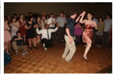
Pictured are dancers at the Auburn Knights Homecoming Swing Dance on November 2, 2012. The event included a group dance class and drew over 400 attendees.