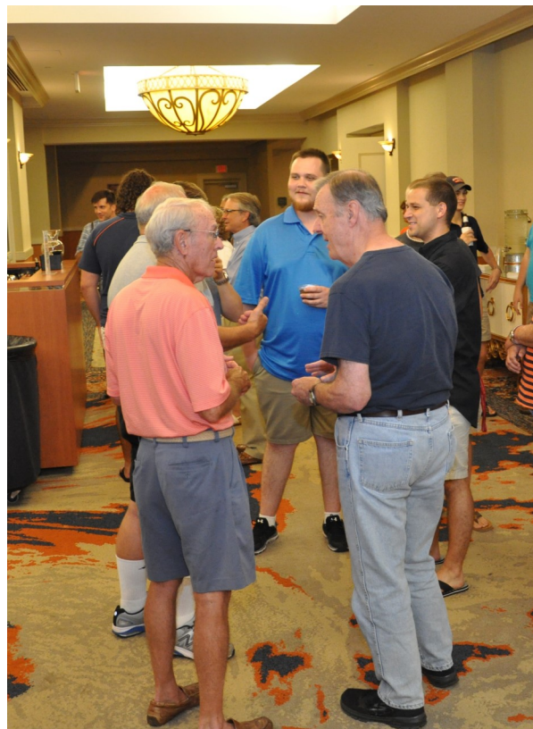
The AKA Friday Mixer made for some terrific conversation!