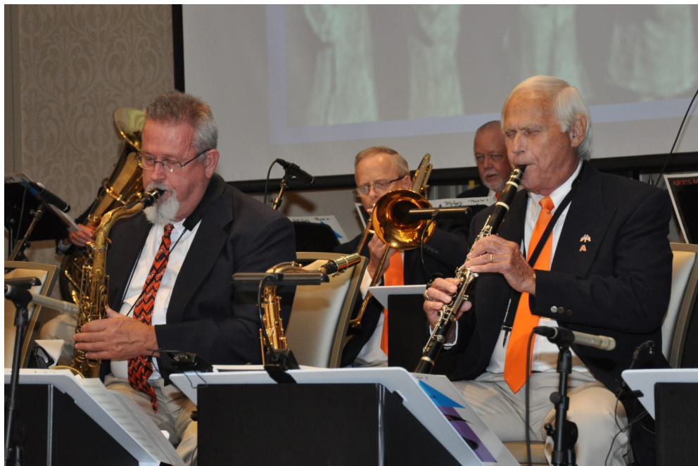
It's a proven fact—you play better with gray hair!